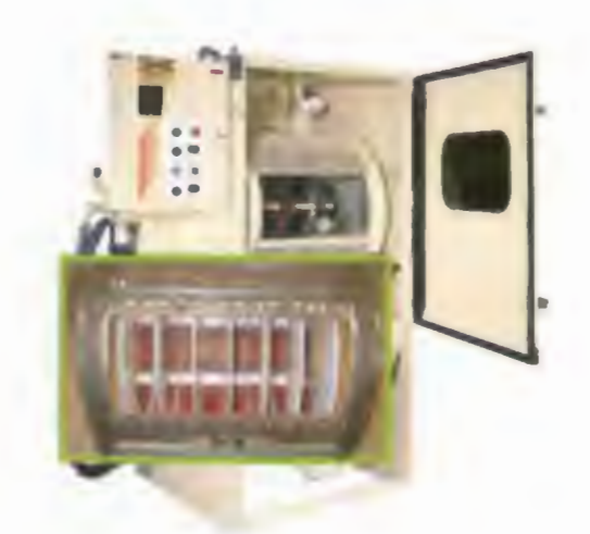
Figure 7. Modified basket blaster not only automates batch processing; it also protects workpieces from exposure to other metal surfaces.

As indicated previously, production-quality cabinets are normally supported by a media reclaimer and dust collector, which adds up to three pieces of equipment. Modified cabinets contain all three ele-