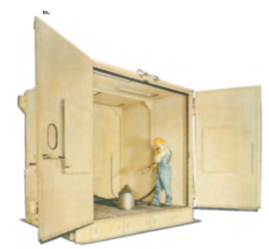
Figure 1. Blast rooms—WITH DOORS CLOSED— provide an isolated zone for finishing larger parts while reducing media replacement and disposal costs.

Blast rooms provide one answer (Fig. 1). These enclosures prevent particulate matter from escaping to the environment while one or more operators, working within the room and wearing protective gear, air blast parts. Rooms are available in many