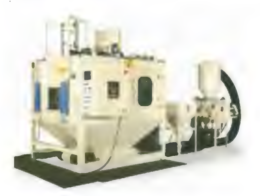
Figure 2. With programmable controls and adjustable fixturing, an automated blast system can now handle a variety of parts without time-consuming changeovers.

recalled and activated with push-button ease. Other advances currently available — and often critical in applications such as aerospace shot peening include default sensors, which shut down the system if processing varies from specified tolerances, and retrievable histories documenting actual blast parameters on individual parts. Although impressive, these innovations, because of high cost, are normally reserved for precision applications. Likewise, automated blasting must be evaluated in terms of capital costs versus savings in labor and gains in quality.