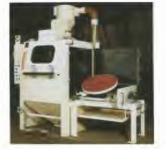
Figure 6. Tilting turntables provide easier access to heavier parts.

Designed for batch processing of small parts, one of the most basic automated arrangements replaces a static work area with a rotating basket and four oscillating guns (Fig. 7). As parts tumble within the basket, the moving blast streams assure even coverage. Timers control blast duration and blow-off cycles. An unloading chute can be added to simplify part removal.