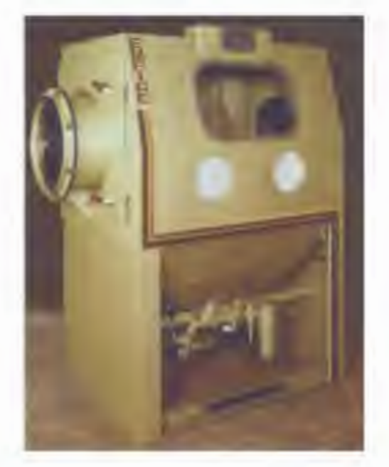
Figure 5. Pipe or other long, cylindrical parts can be finished using a compact cabinet equipped with baffled entrance and exit vestibules.

any weight: up to 10,000 pounds for example. The addition of powered work carts that move parts in and out of the blast enclosure expedite loading and unloading. Processing can be facilitated with a powered turntable controlled by an external foot treadle. Other typical enhancements include tilting turntables that enable operators to adjust the orientation of heavier workpieces (Fig. 6).