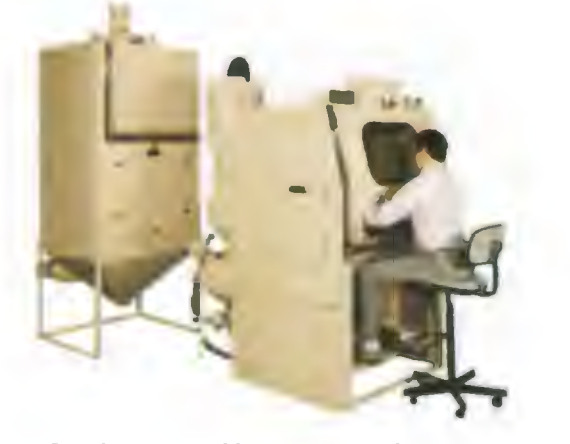
Figure 3. Standard blast cabinets, designed for production applications, include dust collectors and media-recycling equipment

Blast cabinets, in the most basic configuration, consist of an enclosure with a viewing window and sealed gloves enabling the operator to manipulate the blast gun (or nozzle) and the workpiece. Cabinets can be equipped with either suction or pressure blast systems and, at a minimum, should include a dust collector if operated near personnel not protected by hood respirators connected to a clean air source. In production applications, media reclaimers are normally included for reasons of quality and economics. By removing unwanted debris from the blast process before returning good