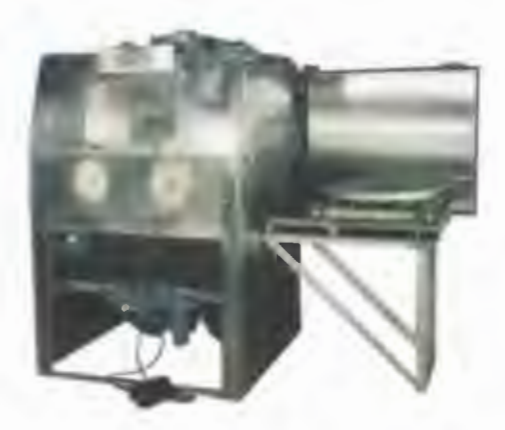
Figure 8. Stainless-steel construction reduces the chances of contamination from other types of steel.