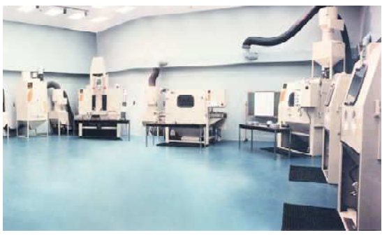
Empire's test laboratory, centered at headquarters with the company's engineering and production teams, uses the empirical approach to find the right mix of media and machinery. Test blasting services are available without charge for industrial customers.

At the same time, cheaper and increasingly sophisticated controls are making fully automated blast systems more affordable by enabling one machine to process different parts (see Figure 4). These machines store instructions for nozzle movement, blast pressure, blast duration, part movement and other variables related to the processing of a specific work piece. Once stored, the recipe for blasting a part can be recalled and put into action with a few touches on a keypad.