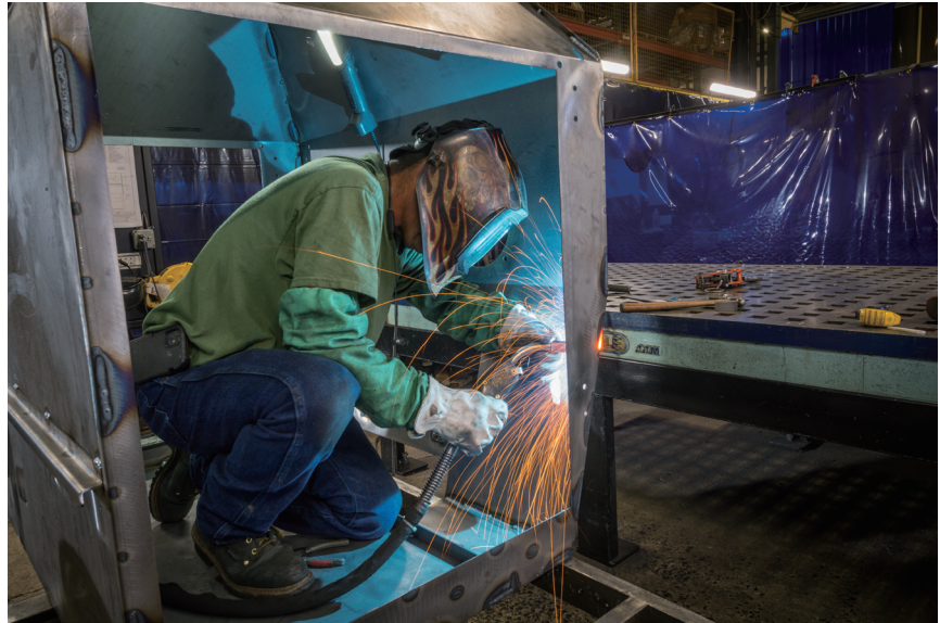
Precision welding at Empire showcases stability through domestic manufacturing

(?) MFN: Does in-house panel manufacturing limit the control platform options available to customers?