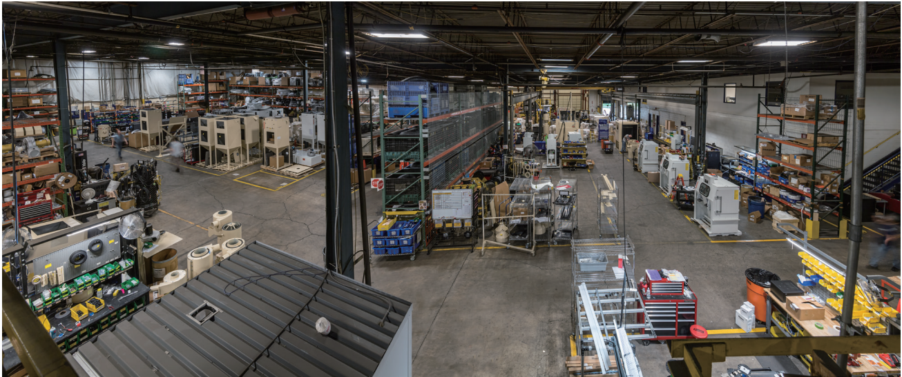
One corner of Empire's commitment to US manufacturing

They give us the ability to deliver consistent quality, adapt quickly to customer needs, and stand by our products for years to come. That's the essence of The Empire Advantage.