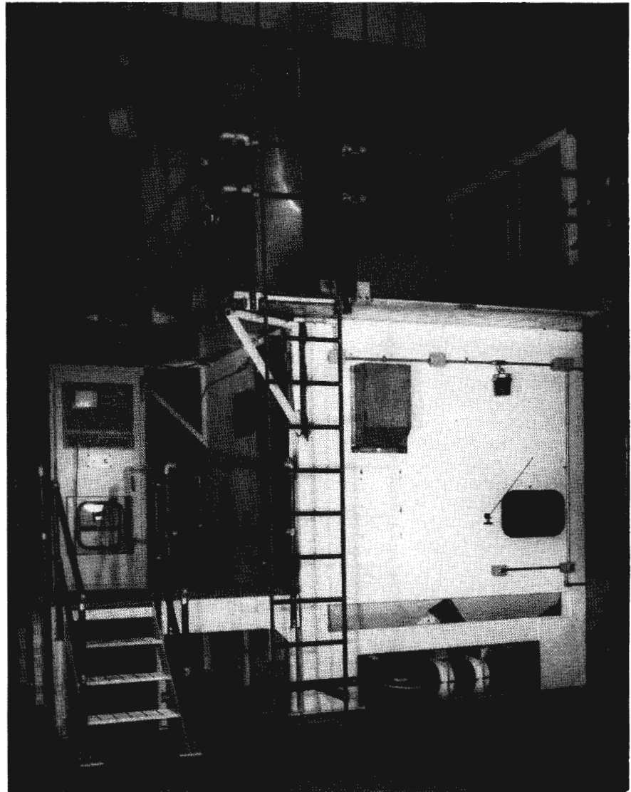
Fig. 3. Programmable CNC peening machine capable of classifying different types of shot.

peening has been the application of increasingly sophisticated programmable controllers to pneumatic equipment. With these controls, processing instructions related to nozzle and workpiece movements, peening duration, shot flow and shot velocity are entered into the system via a control panel. If the system includes multiple work stations, information for each station as it relates to the processing of a particular part is stored. Some systems capable of classifying different types and sizes of shot even make it possible to program shot selection. After processing parameters for a specific part have been stored, the data can be accessed and put into action by recalling information assigned to that part. Key peening variables can also be printed out with this type of equipment to support the fact that peening was performed to specifications and