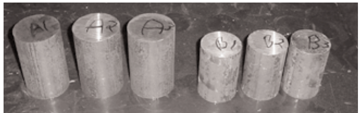
Billets on the left with light rust and moderate scale could be cleaned to a near-white-metal finish with either a suction or pressure system. Billets on the right with heavier scale, added to customer requirements for expandable blast capacity, indicated that a pressure system was the preferable choice.