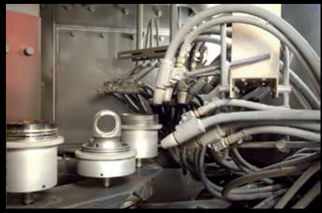
Indexing Turntable Machine coordinates 16 blast guns, oscillating vertically and horizontally, with rotating work stations to assure thorough cleaning in a single pass.

Shot-Peening Turntable includes a vibratory classifier plus closed-loop control and monitoring of shot flow, blast pressure, rotation speeds and nozzle oscillation rates.