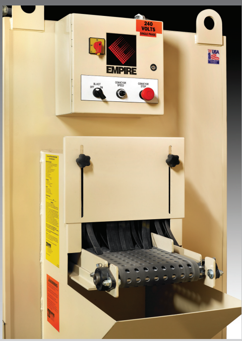
The IL-885 conveyor includes variable speed controls and adjustable parts guides to handle a wide range of blasting applications.